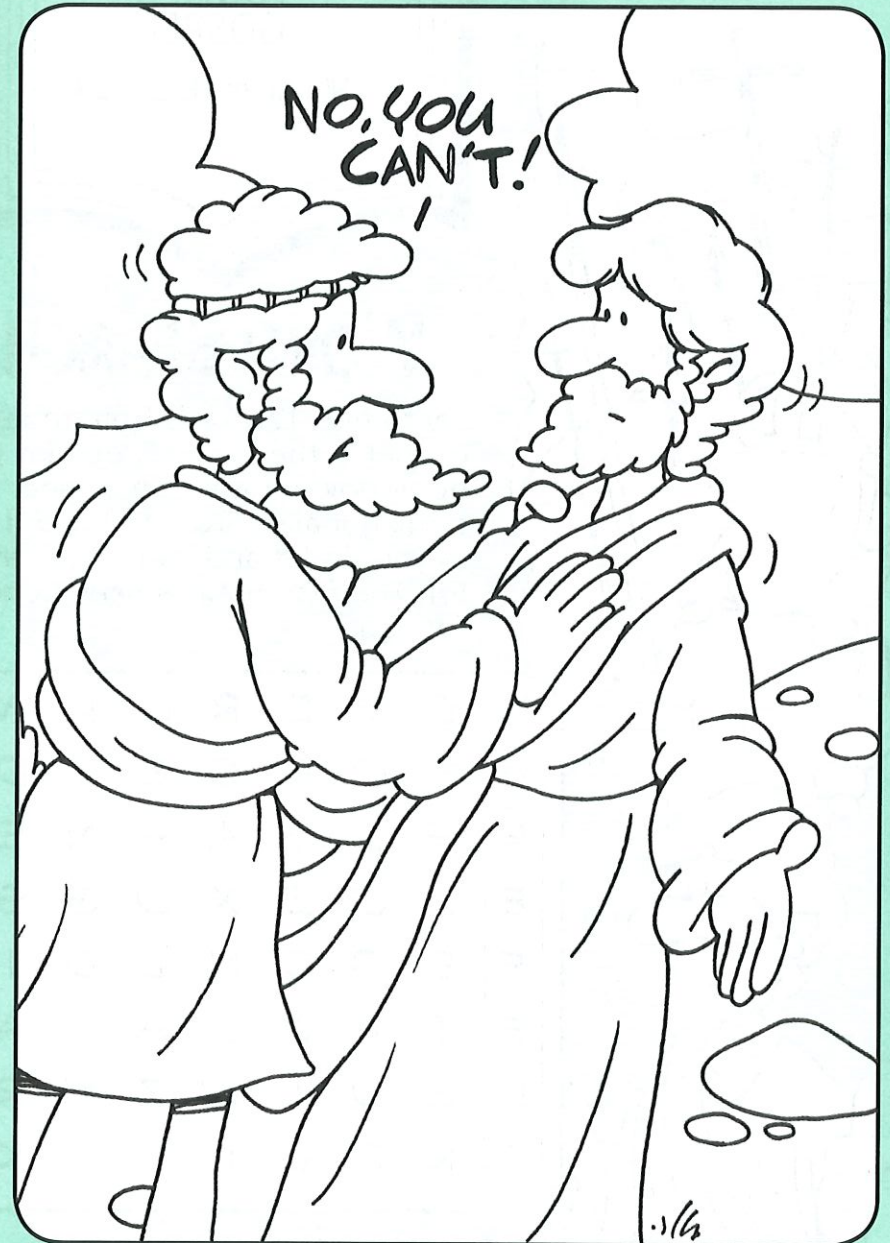
Peter took Him aside and began to rebuke Him. Matthew 16:22