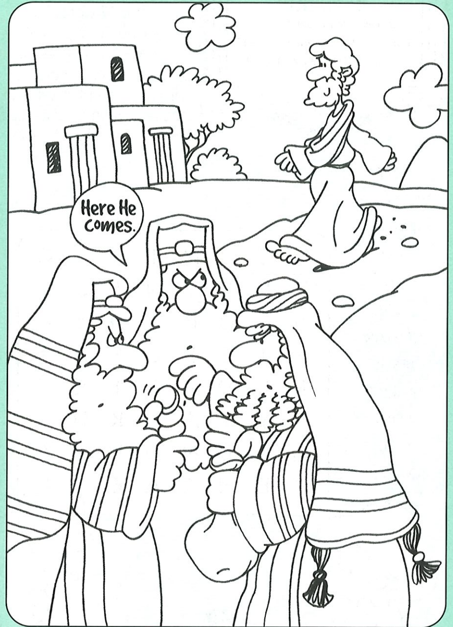
The Pharisees went and plotted how to entangle Him [Jesus] in His words. Matthew 22:15