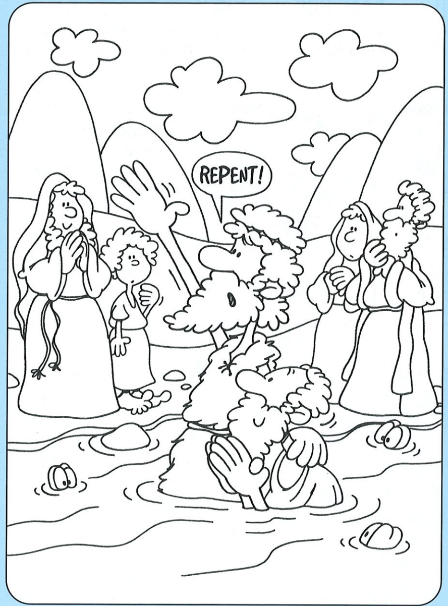
John appeared, baptizing in the wilderness and proclaiming a baptism of repentance for the forgiveness of sins. Mark 1:4